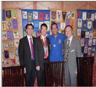
A Brazilian Rotarian came to visit us after the meeting