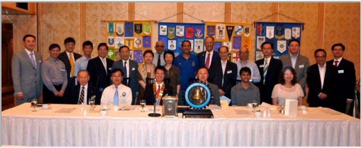
Group photos with members, visiting guests & guest speaker