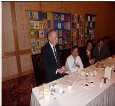
PDG Uncle Peter reported the Red box collection