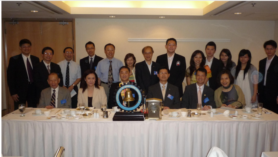
Group photo with members, speaker & visiting guests