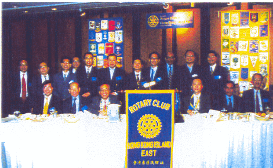
Group Photo of all of our members present on 11 th June, 2003.