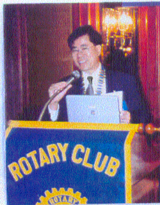
Pres. Stephen welcomed the big delegations from two visiting clubs.