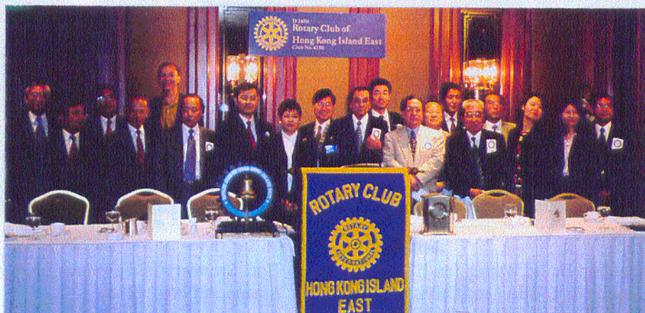
Island East group photo with HK Harbour R.C. and Kawasaki South R.C.