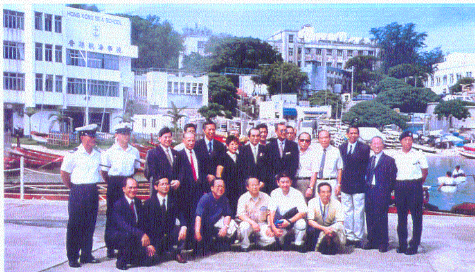
Island East and Kawasaki South R.C delegation visiting HK Sea School on June 13, 2002.