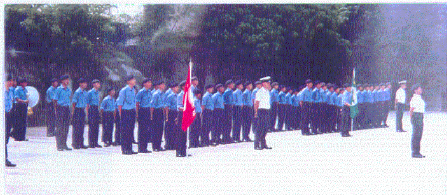
The marching parade - welcoming Island East & Kawasaki South