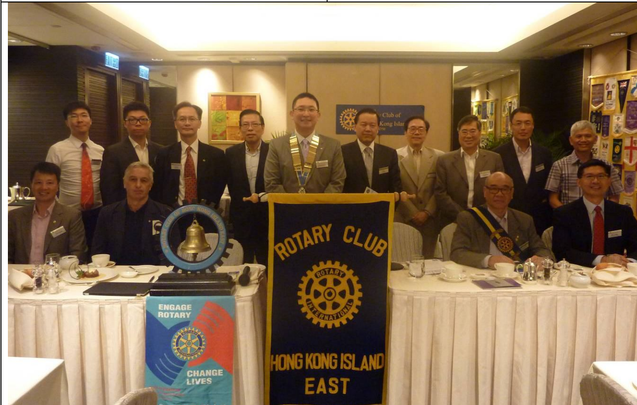
Group Photo of the meeting on 4 th June, 2014