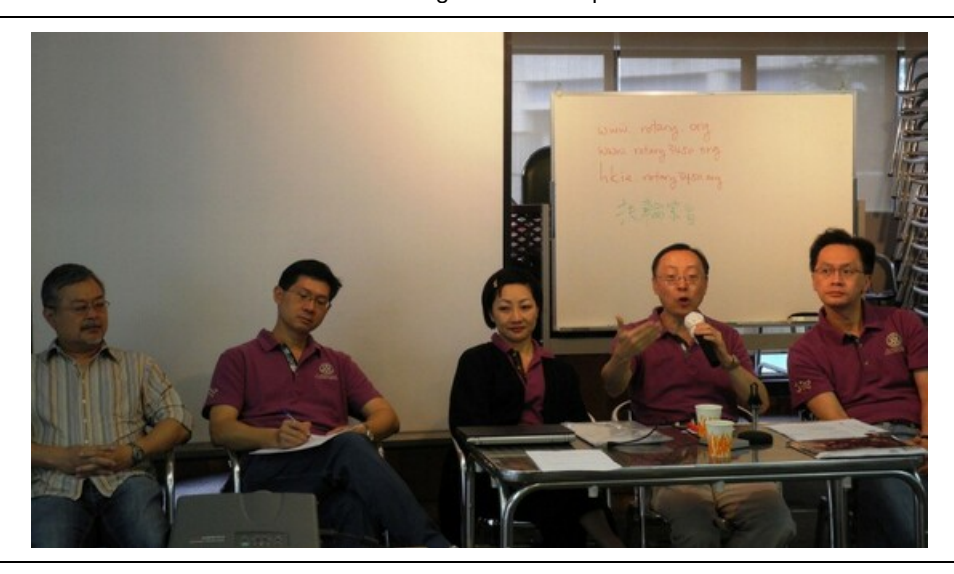
From the panel of speakers - How can we make our Rotaractors and Interactors more outstanding?.