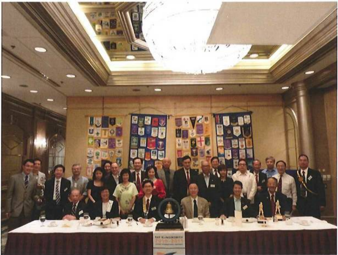
The Group Photo of our meeting on 25 th May, 2011