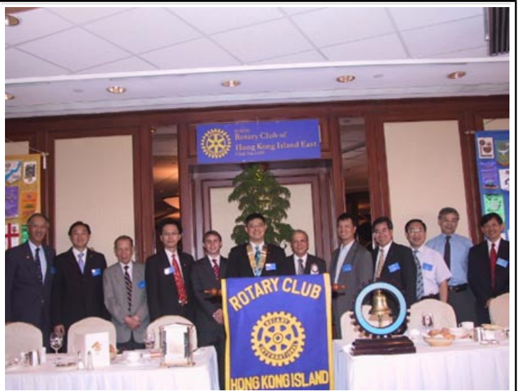
Group photo after the meeting