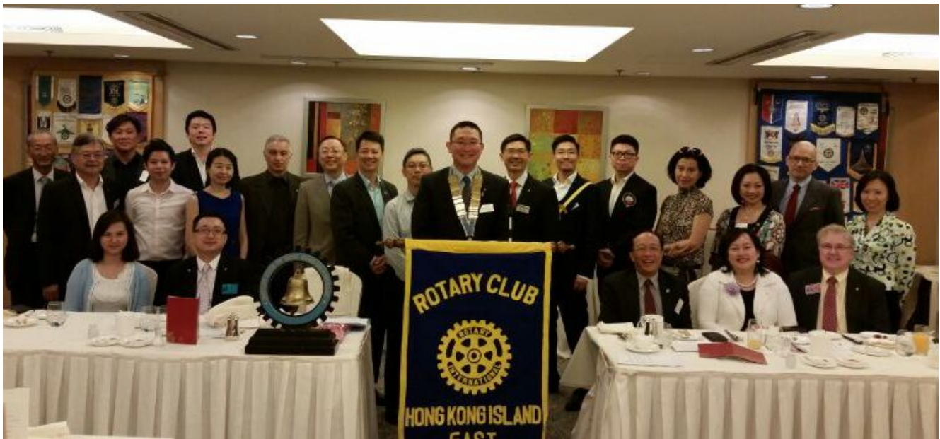
Group Photo of the meeting on 28 th May, 2014