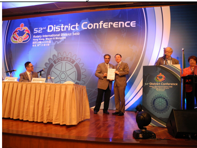
HKIE awarded in Call for Papers