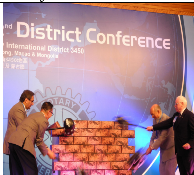
ROTARY Broke barrier wall