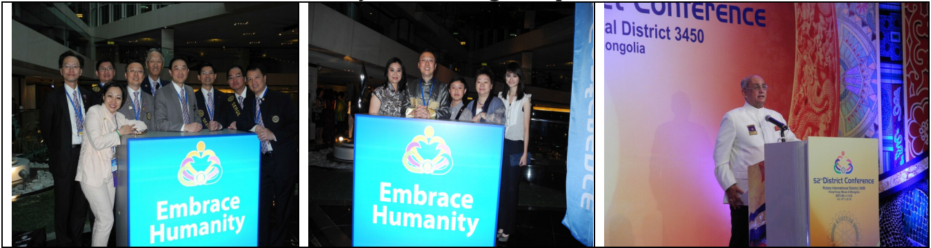
House of Friendship counter