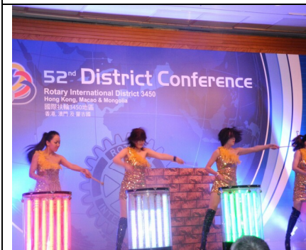
Drum Dance at Opening