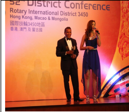
Singers performance at DG Banquet