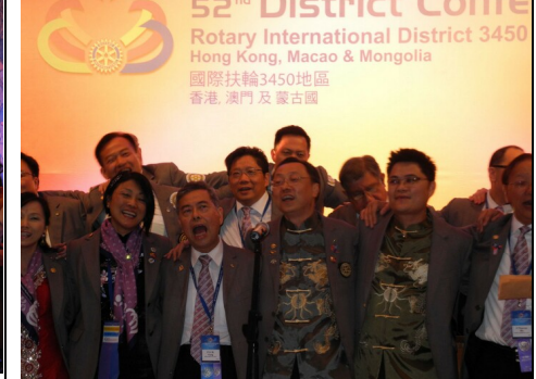
Presidents thank you song to DG