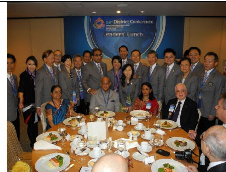
Leaders' Lunch with RI President