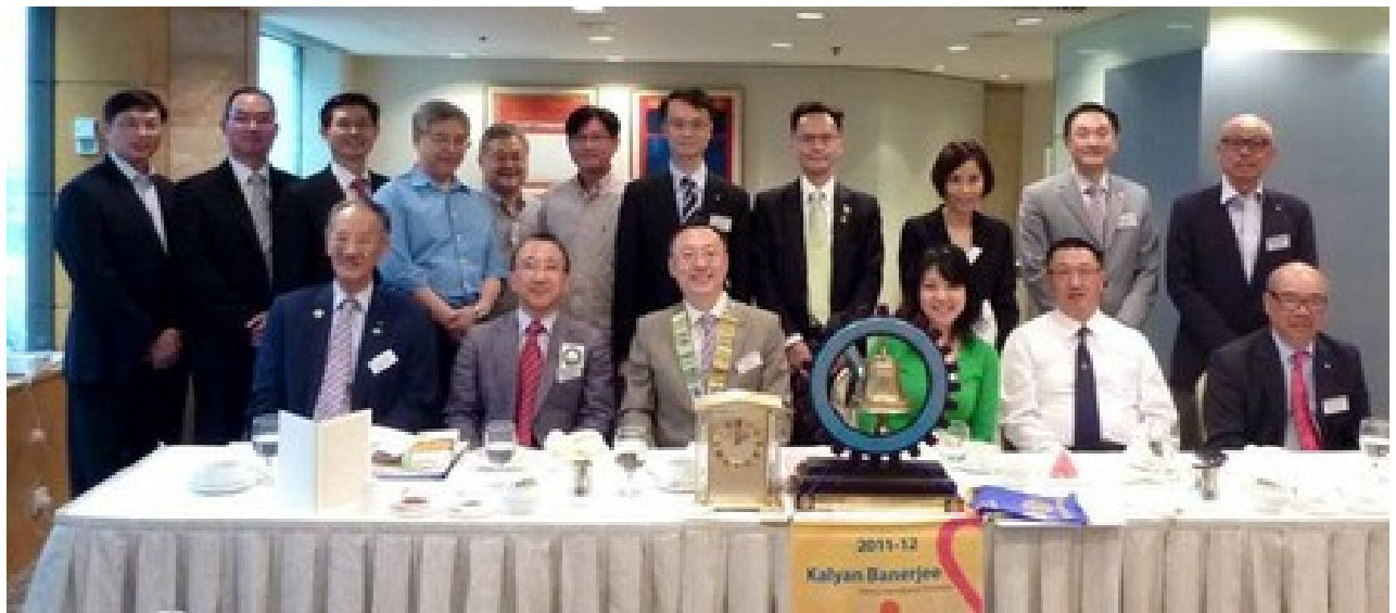
Members group photo