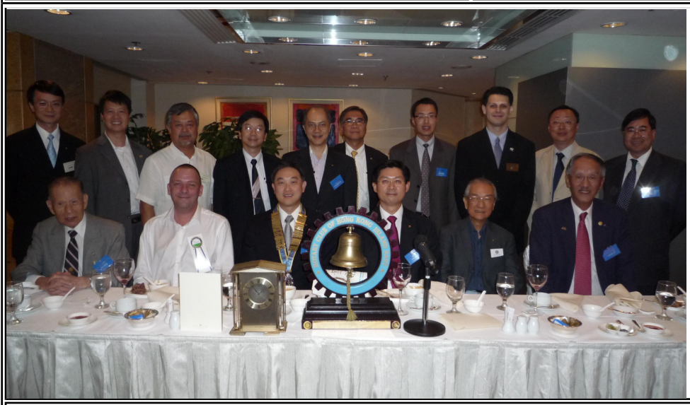
Group photo with members, speaker & visiting Rotarians