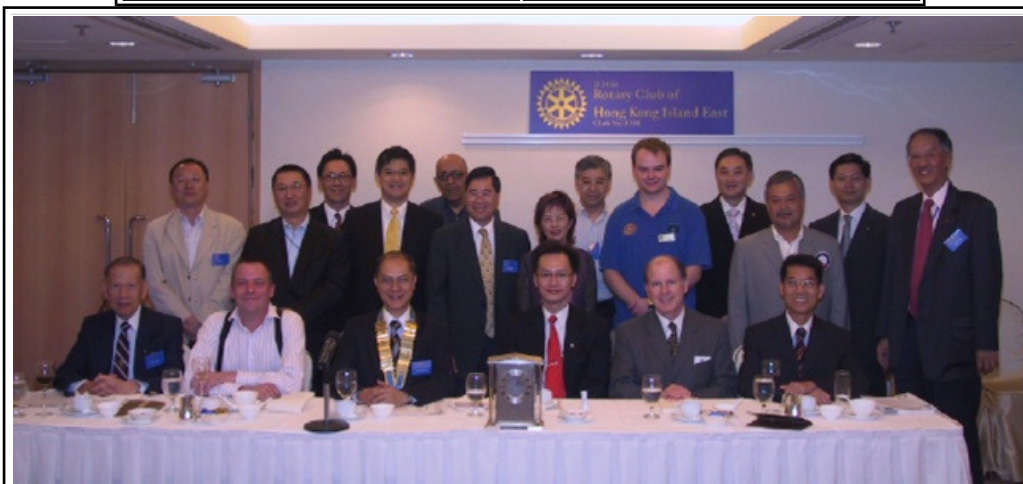
Group Photo with members, visiting guests and the speaker