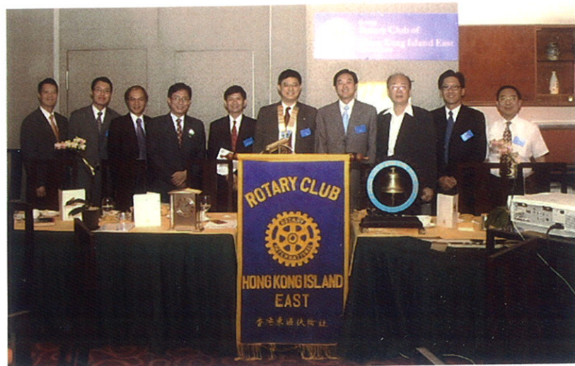
Group photo on May 24, 2006