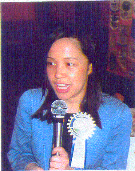
Ms Pearl Lam, our guest speaker talking about Succession Planning & Why we need it.