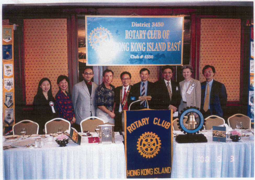
Visitors & guests to the club, 3 May, 2000