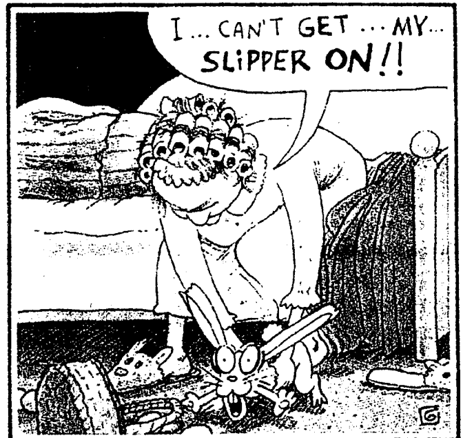
THE EASTER BUNNY GETS A RUDE AWAKENING.

I know, Becky whispered softly. "That's why I poisoned you."