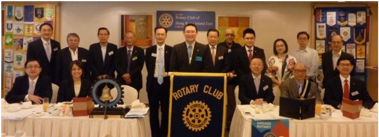
Group photo with Guest Speaker and visiting Rotarians