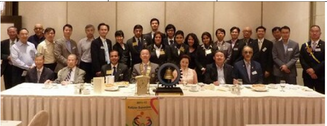
Group photo of members & visiting guests.