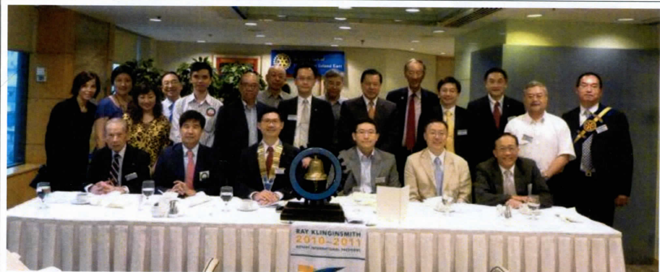
Group photos with Guest Speaker, visiting guests & club members