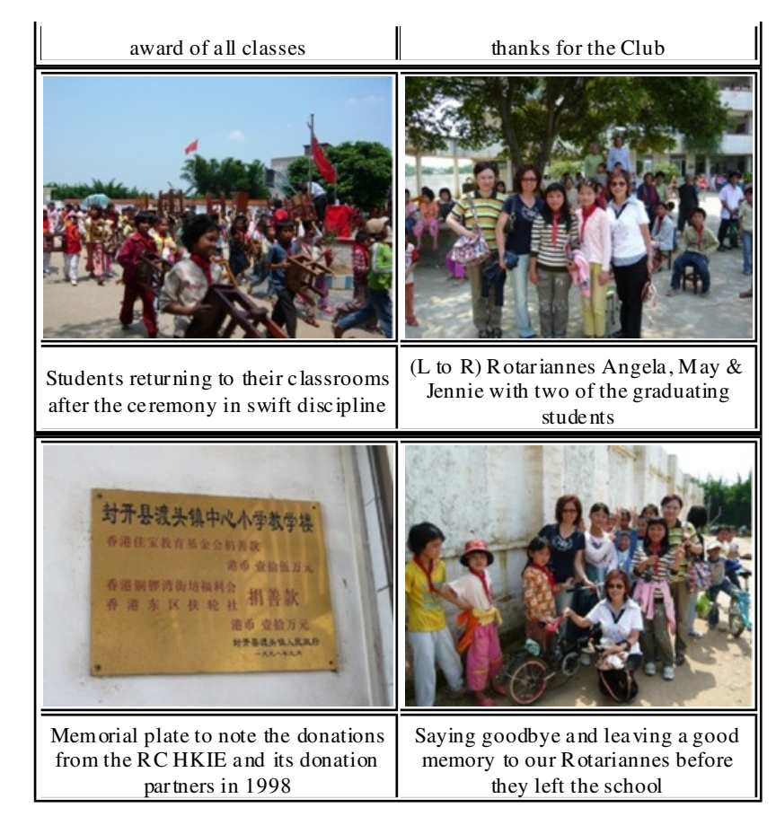
pre vious home