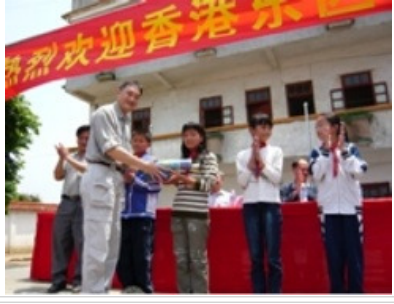
PE Andy presenting the stationery to the representatives of the students