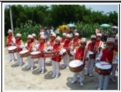
Welcoming parade of the Dao Tau Primary School students