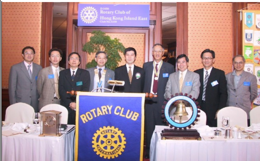
Group photo of guest and members of HK Island East luncheon May 25, 2005