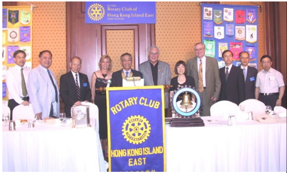
The group photo of visiting Rotarians & guests on 2nd June, 2004.