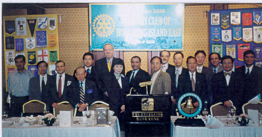
Thank you for visiting us, Members of the Rotary Club of HK Northeast & the Rotary club of Kwai Chung on 16 th May, 2001.