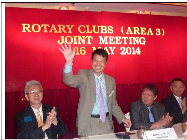
PPE Norman greets everyone