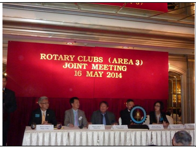
Part of the head table with five Presidents of the host clubs