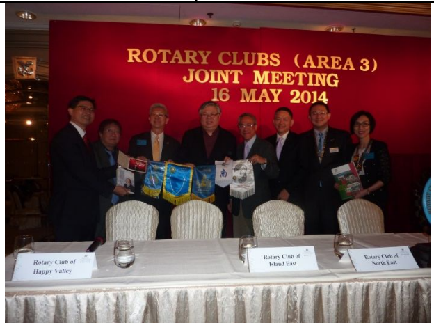
All Club Presidents giving souvenir banners to the guest speaker