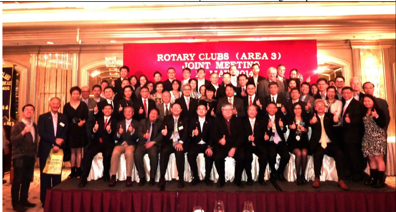
Group Photo of the meeting on 16 th May, 2014