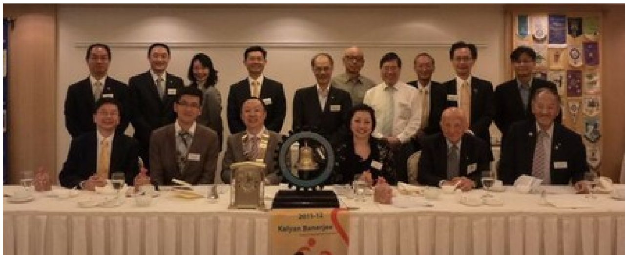
Group photo of members & visiting guests.