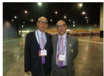
RI Convention Opening Ceremony