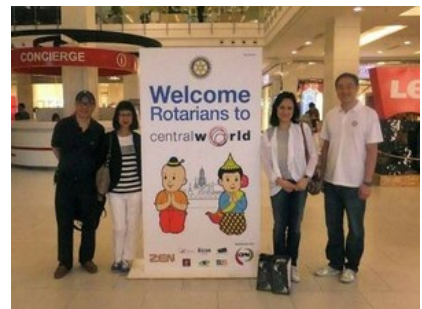
RI Convention Registration - 06 May at 7:30 am