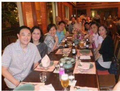
First night RC HKIE fellowship dinner - 05 May