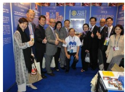
DG Fellowship Dinner - 06 May - Bangkok Holiday Inn Silom Hotel