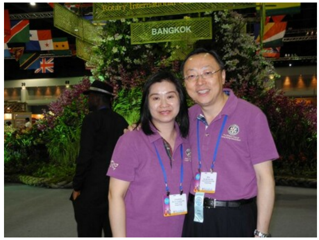
Sister Club Fellowship Dinner on 07 May - Dusit Thai Hotel Hosted by RC of Osaka Jonan, joined with RC of Penang, RC of Makati North & RC HKIE