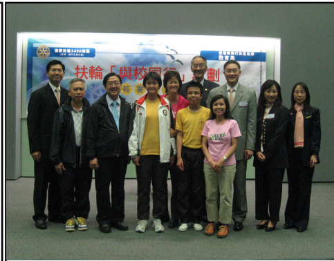
Photo with our members & Choi Jun school Principal, teachers, students & parents