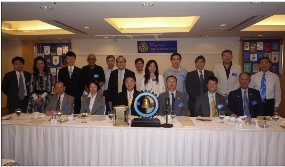
Group photo with members, speaker & guest