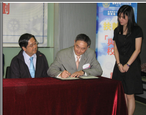
Rotary Adopt-A-School program - Signing ceremony with Pres. Andy (middle)