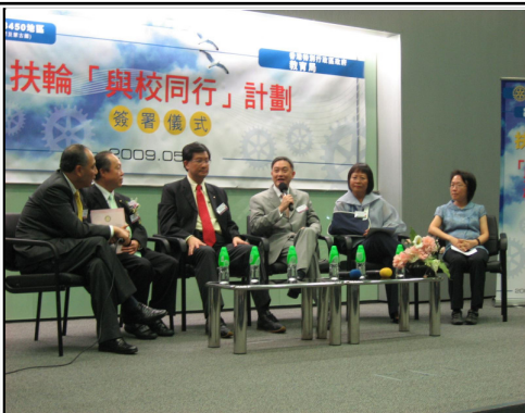
Rotary Adopt-A-School program - Sharing session