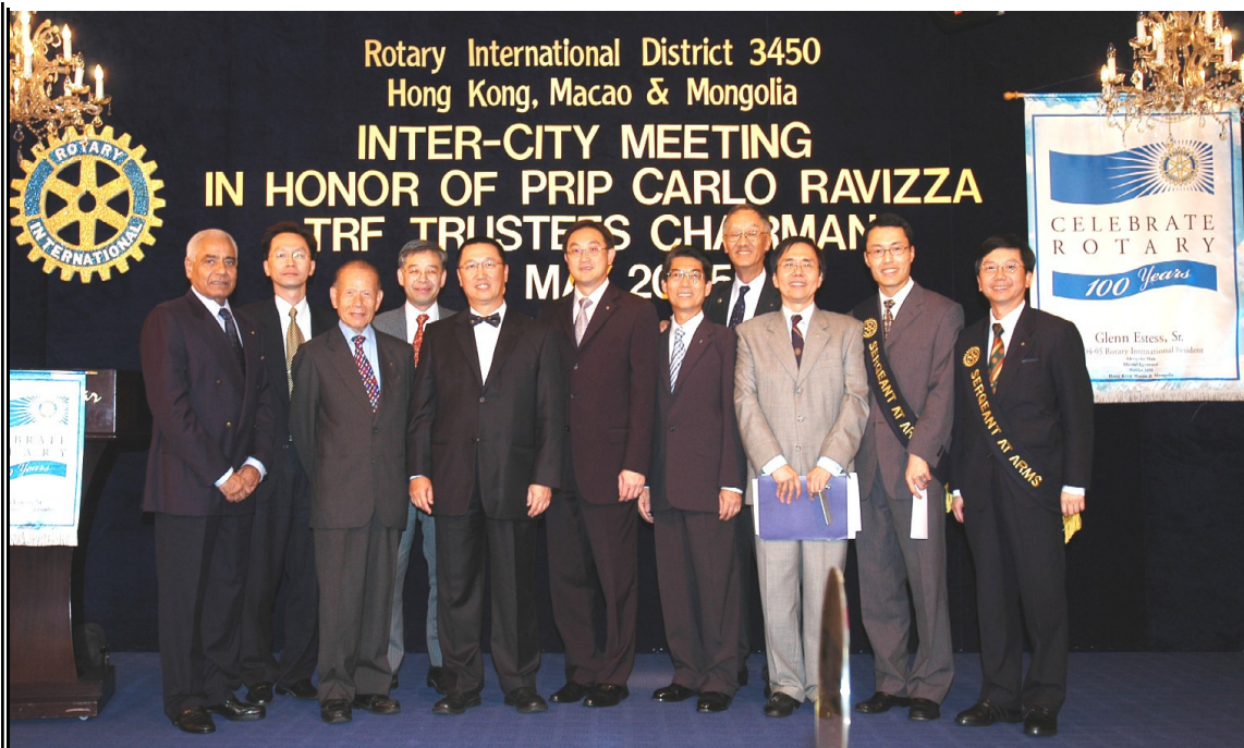
Group Photo of our Rotarians who participated in the InterCity Meeting.