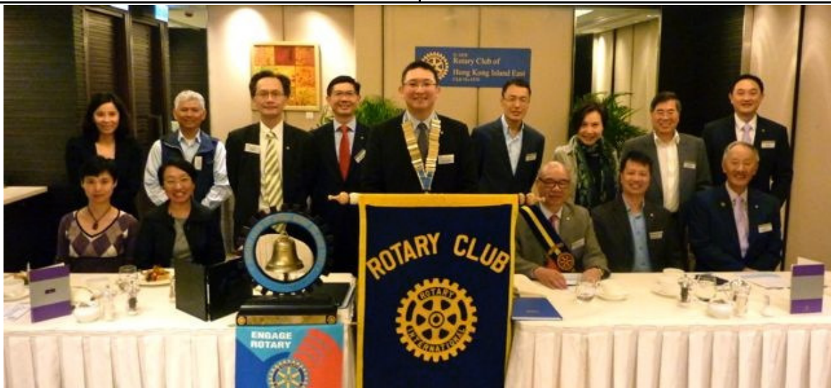
Group photo of members & guest speakers