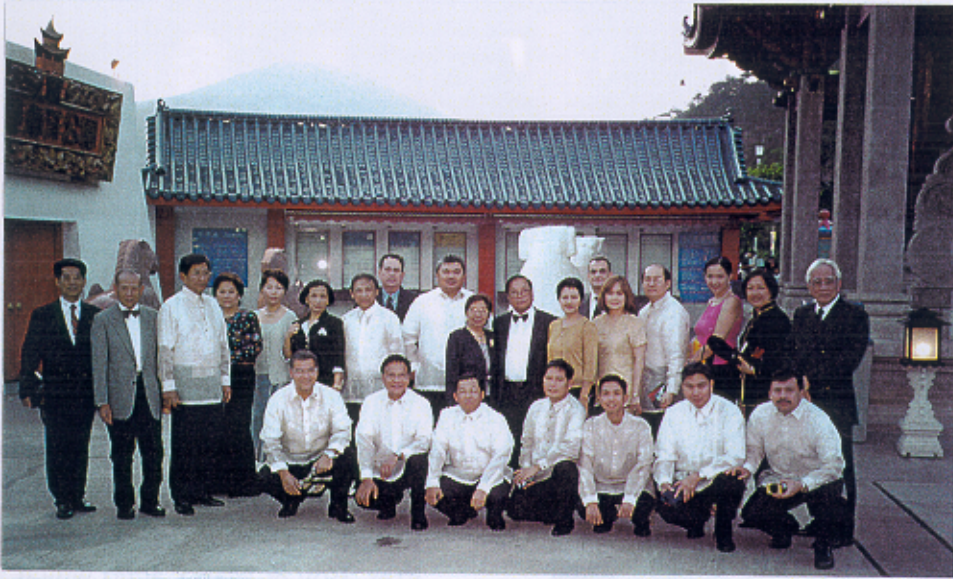
Our guests assembled at the entrance of the Middle Kingdom Theater Restaurant.