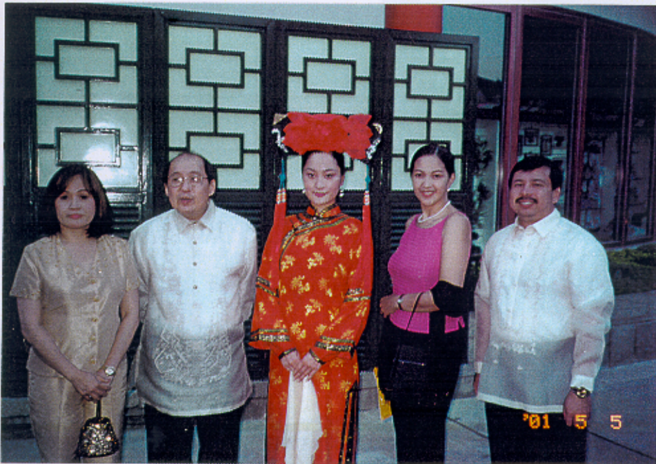
Picture of our guests with the beautifully costumed hostess.