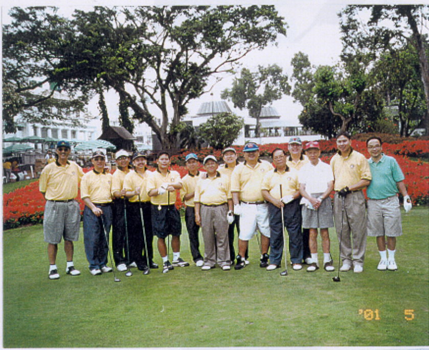
The group shown here about to tee-off at Fanling Golf Course for a friendly match.