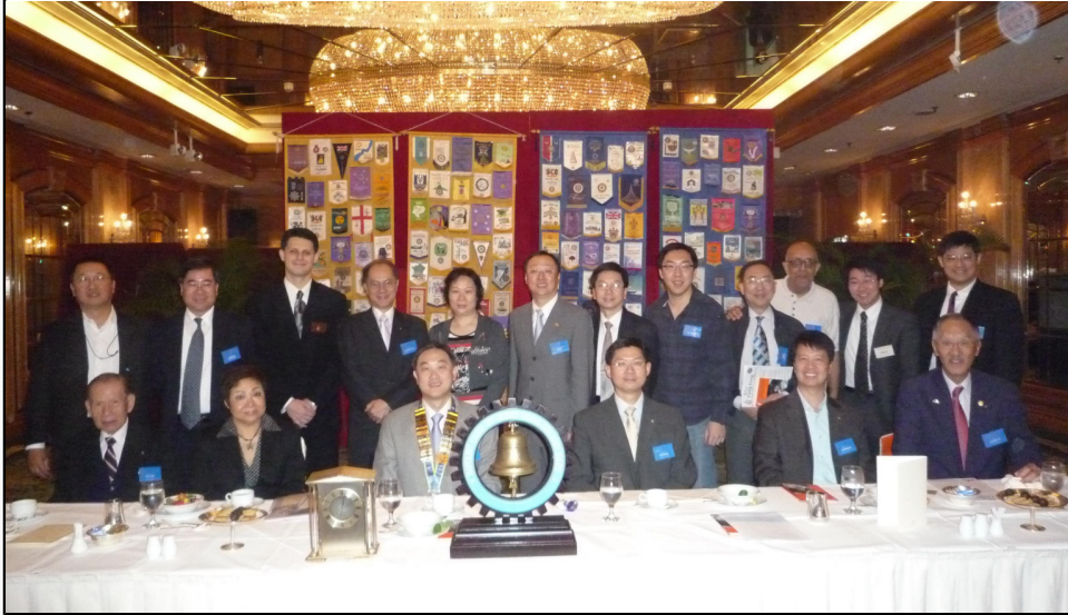
Group photo with Guest & visiting Rotarian