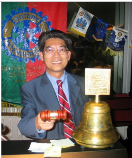
PP C.Y. hitting the bell for $100 to the charity.