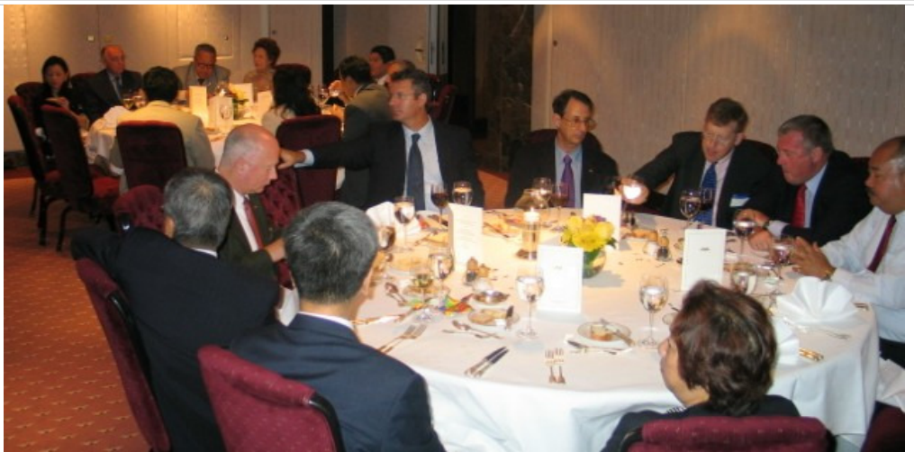
A further view of the dinner party.