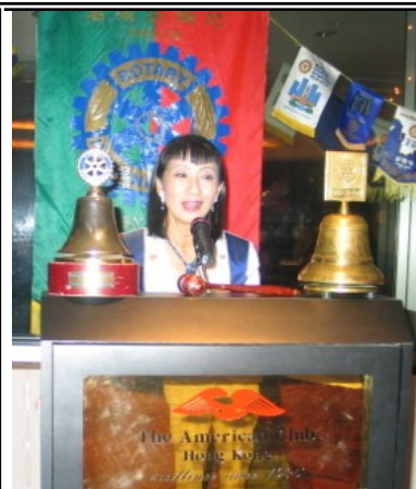
IPDG Gloria also addressed us.