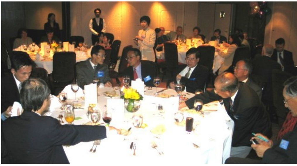
General view of the dinner .