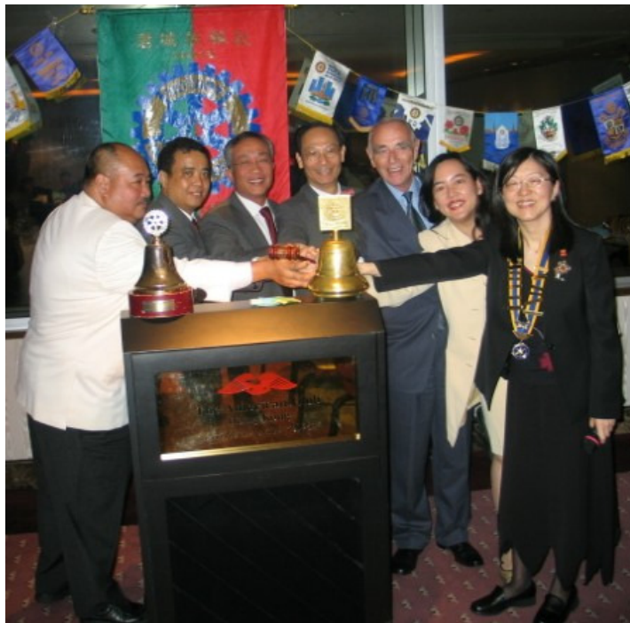
District Officers & four Presidents of clubs seen here hitting the bell together. Is that a $700 hit?