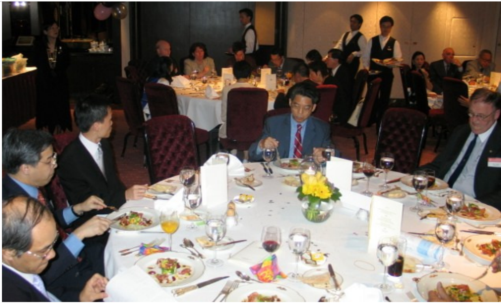
Another view of the dinner party.