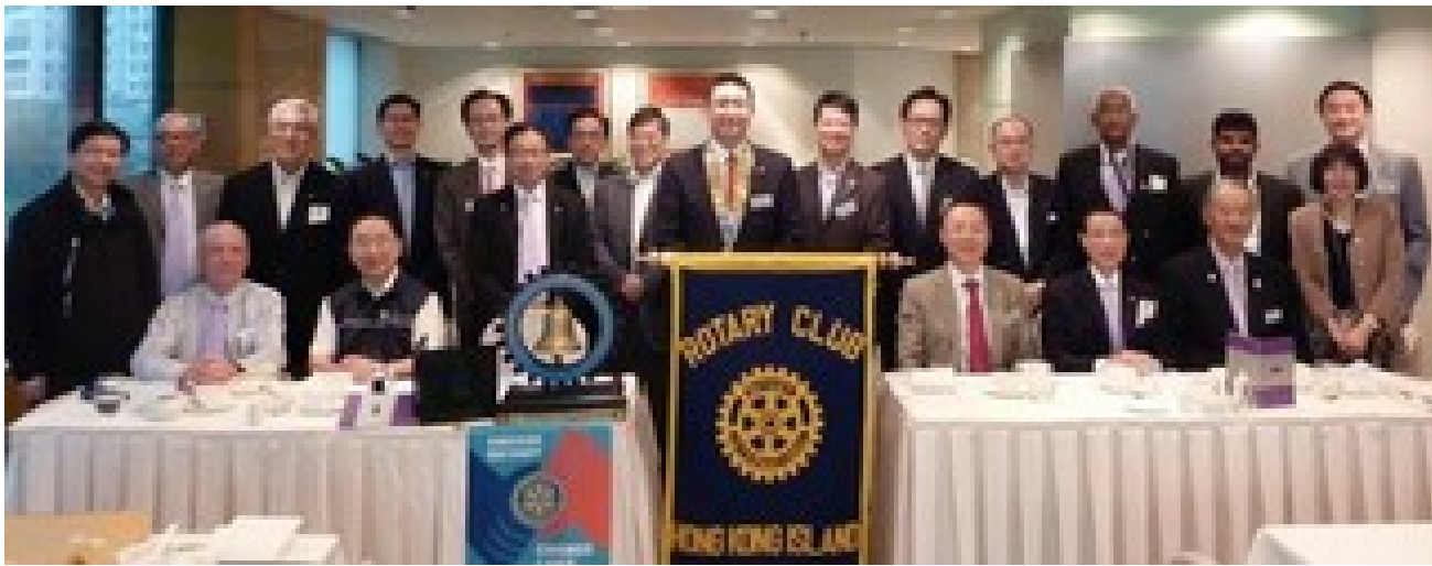
Group photo of members, visiting Rotarians & guests.