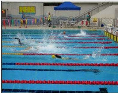
other swimming competitions