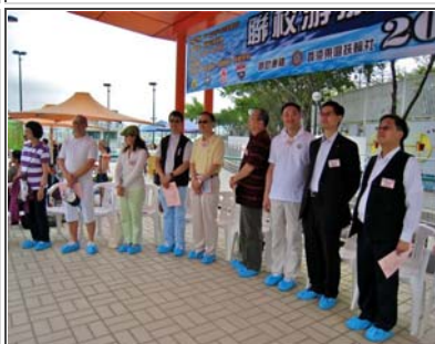
All guests standing up for the national anthem before the swimming competitions