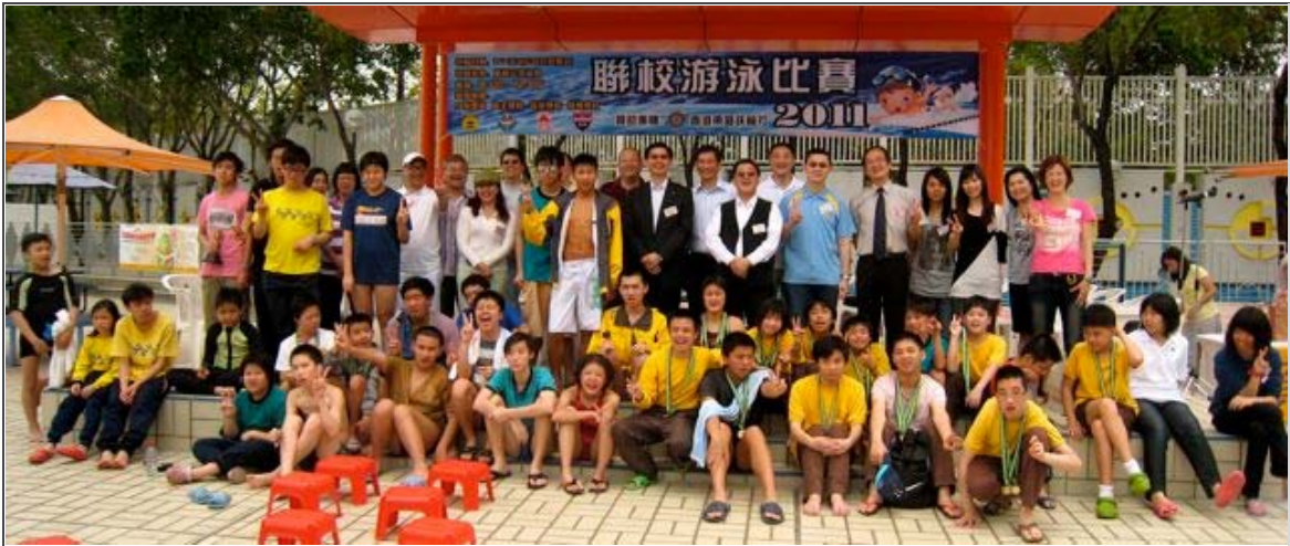
Group photos with all the students, parents, teachers, principals, invited guests, Rotarians & Rotaractors