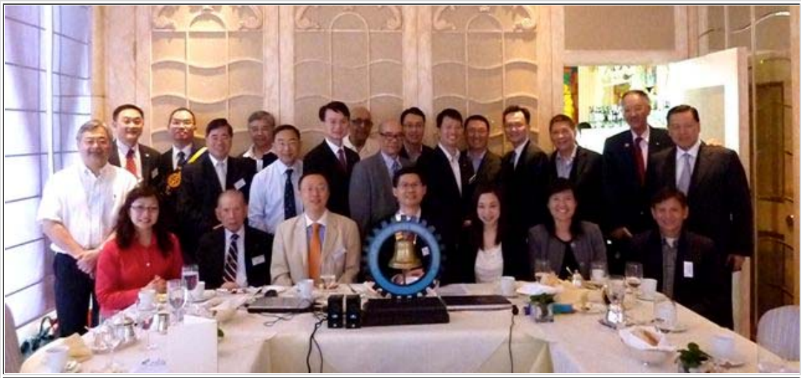
Group photo with members & visiting guests