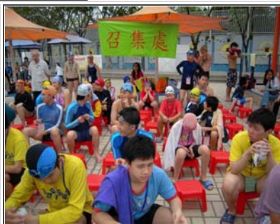
Stuents waiting at the assembly point