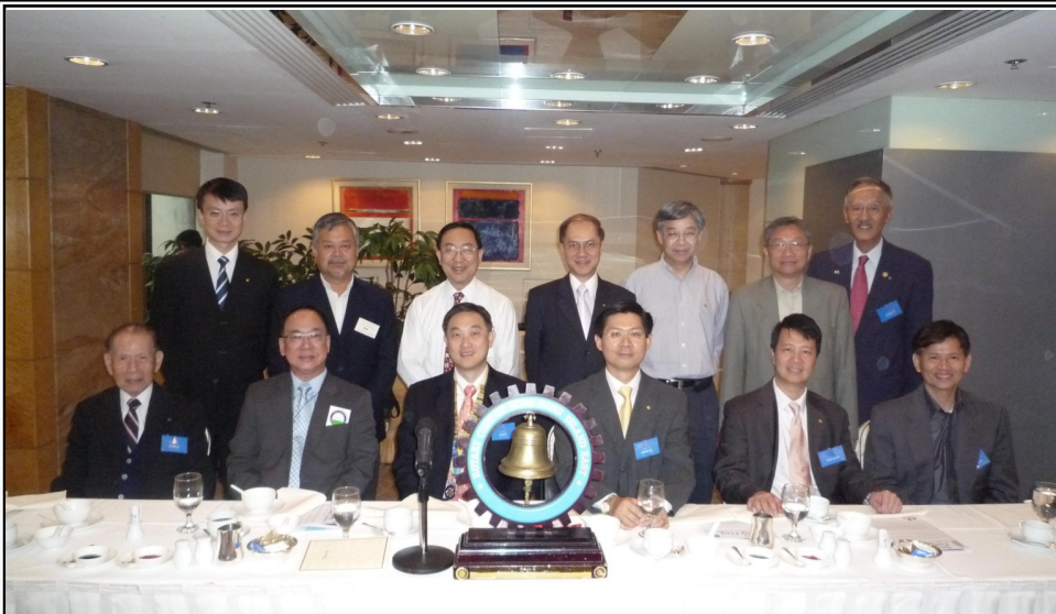
Group photo with members & Guest Speaker