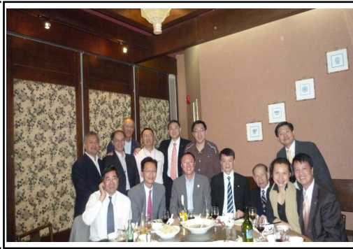
OC Group photo