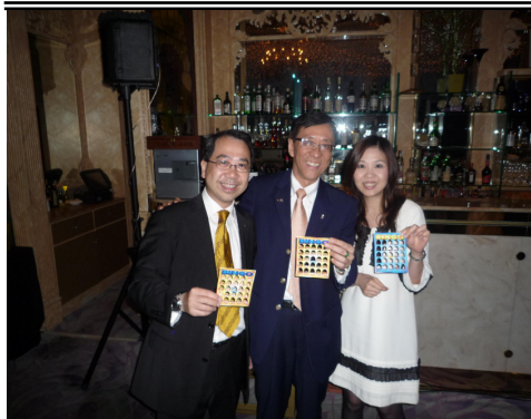
The three finalists waiting for just one more number to win the grand bingo game