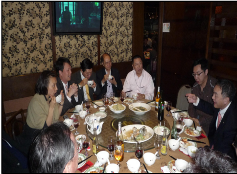
Everybody enjoyed the food, wine and fellowship