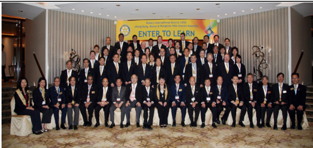
2009-2010 Incoming Presidents and all the incoming District Officers