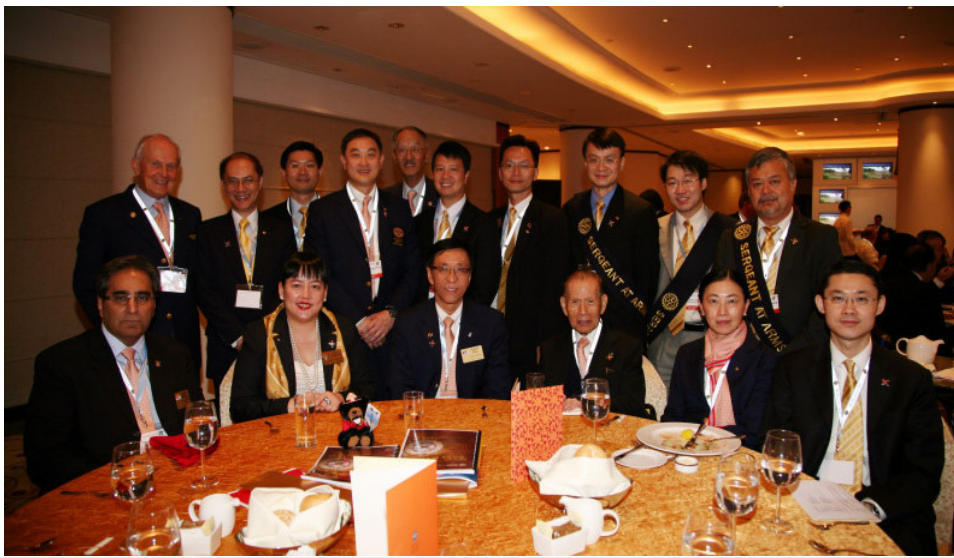
Members of RC of Hong Kong Island East and organizing team members take photo with the District Officers