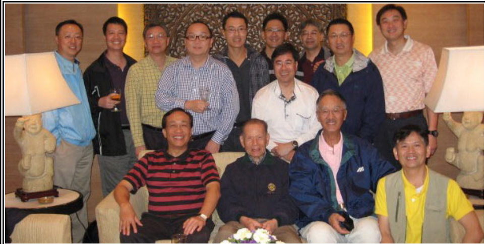
The whole group assemble before the dinner.