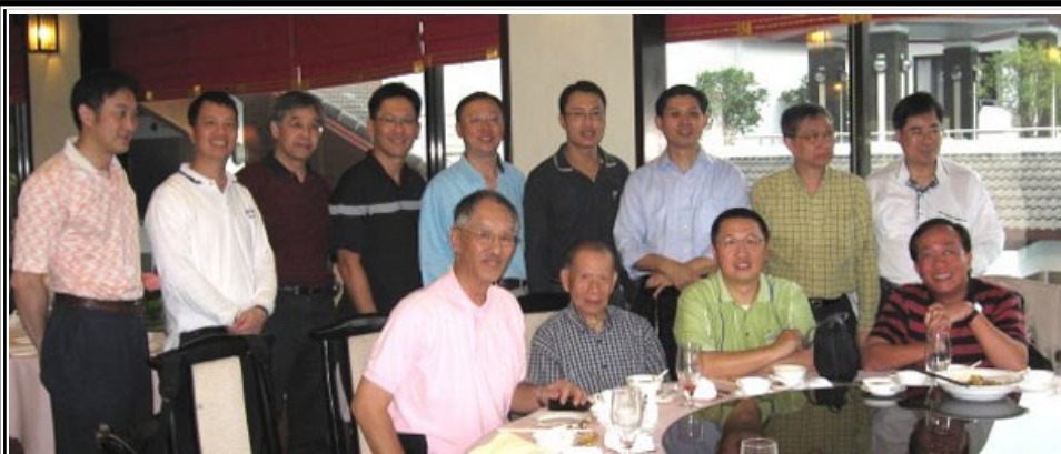
After resting we were treated to a sumptuous dinner at the Laurel Restaurant in Shenzhen. See the table setting.