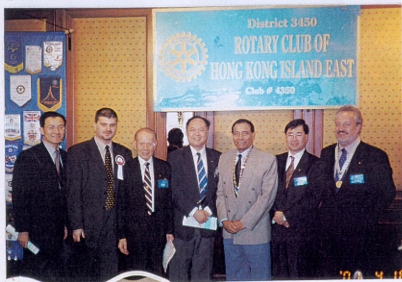
Visiting Rotarian & guest pictured on 18 th April, 2001.