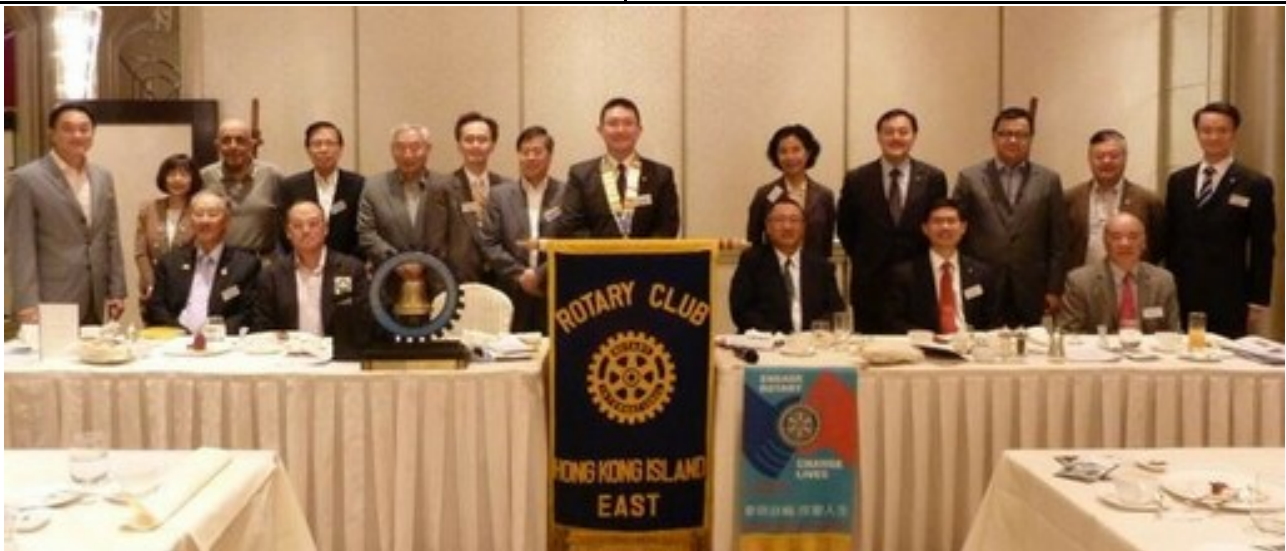
Group photo of members, guest speaker & visiting guests.