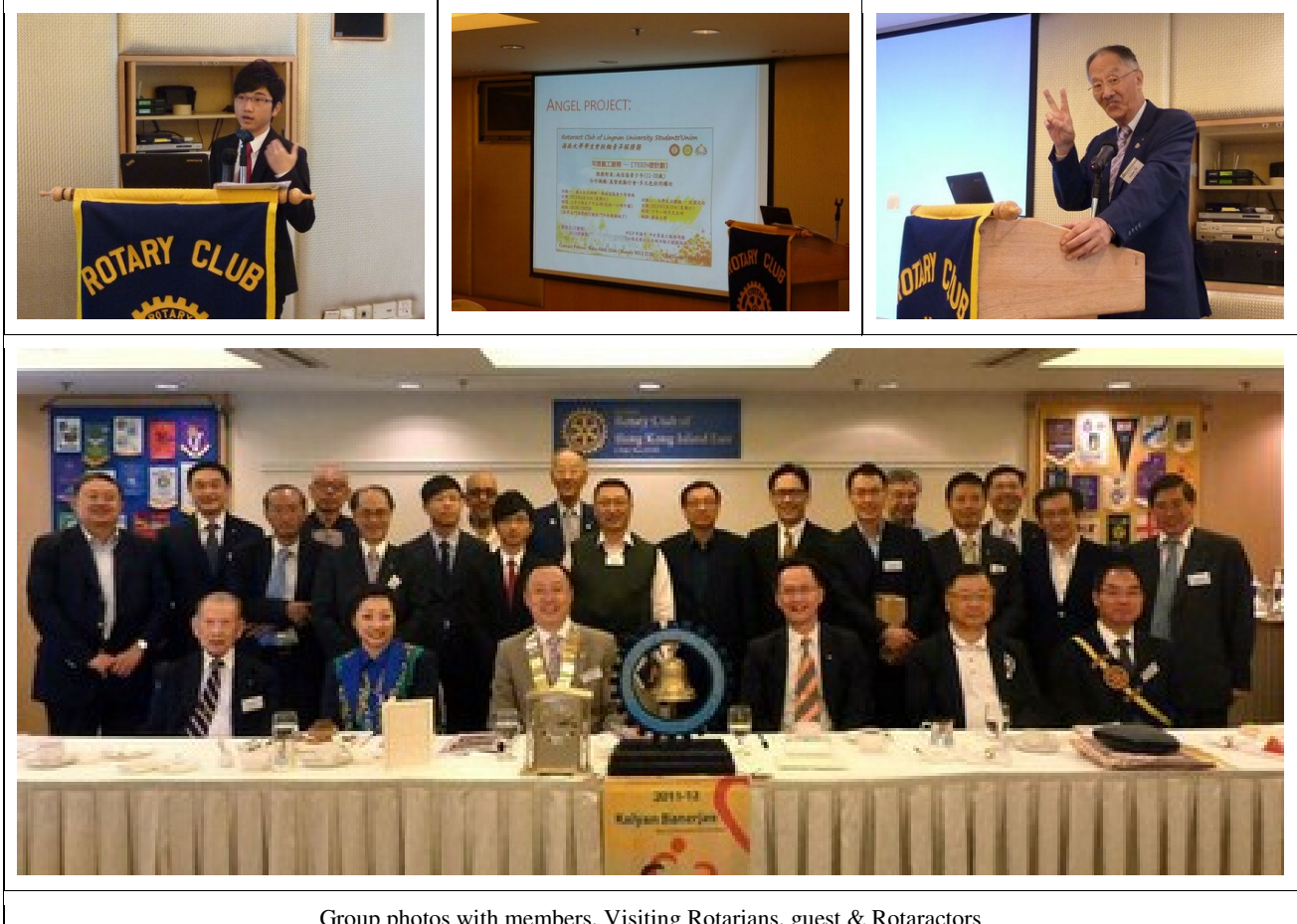
Group photos with members, Visiting Rotarians, guest & Rotaractors