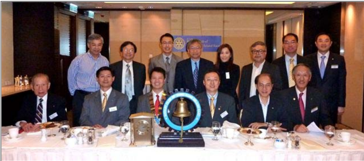
Members group photo