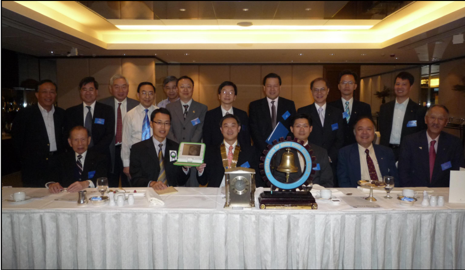
Group photo with members & visiting Rotarian