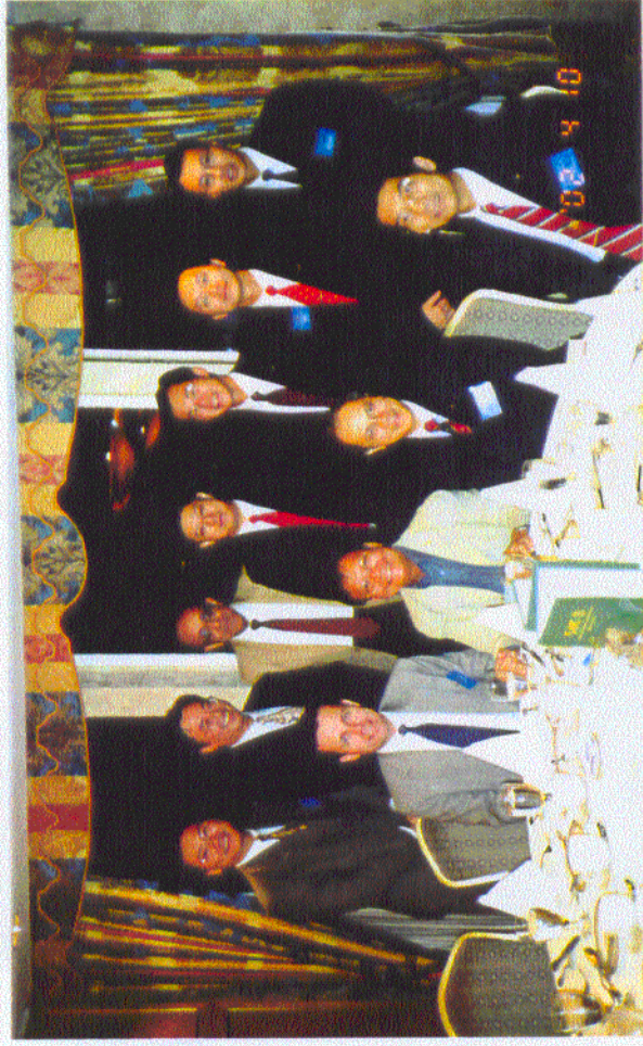
Pres. Boy (Makati North) took a group photo with Island East members and guest.