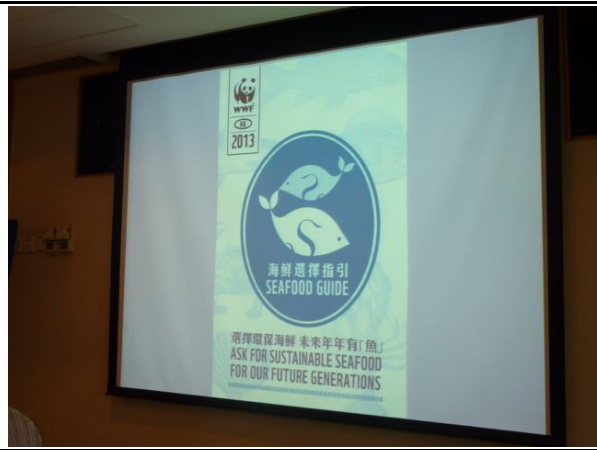
PP George Li promote how clubs can support the - Towards a Green Rotary District - Green Rotary Club project.