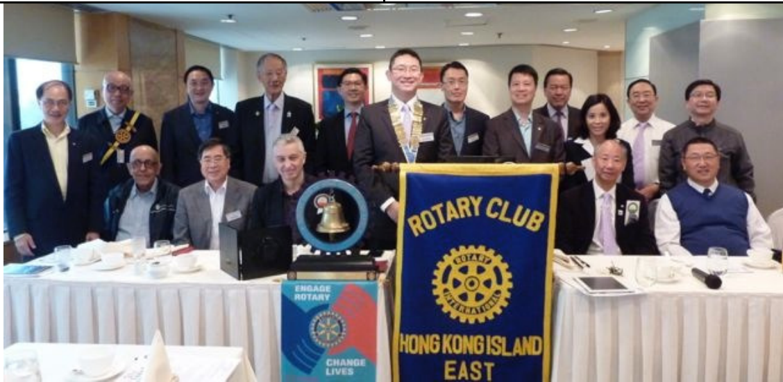
Group photo of members, guest speaker & visting guest.