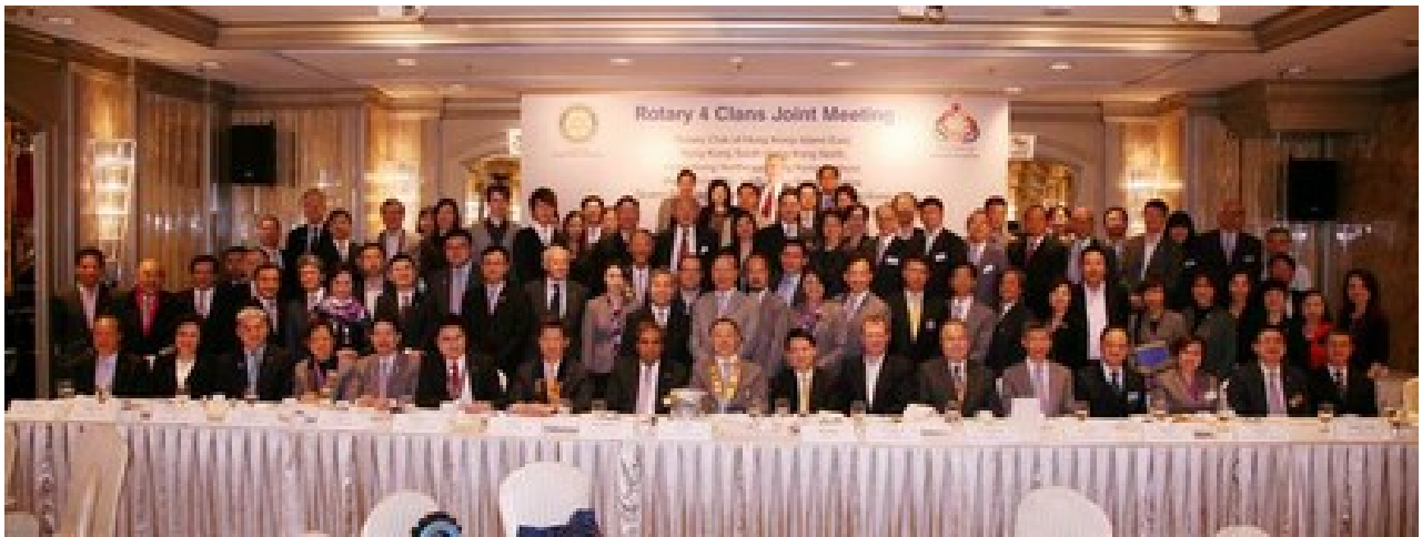
4 CLANS GROUP PHOTOS