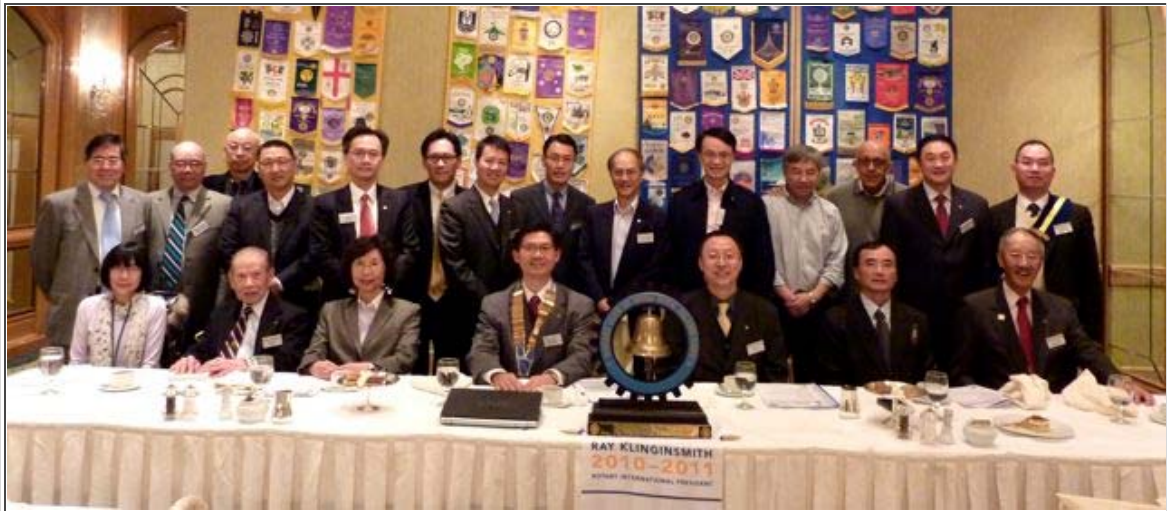
Group photo with guest speakers, visiting guests, rotarians & members