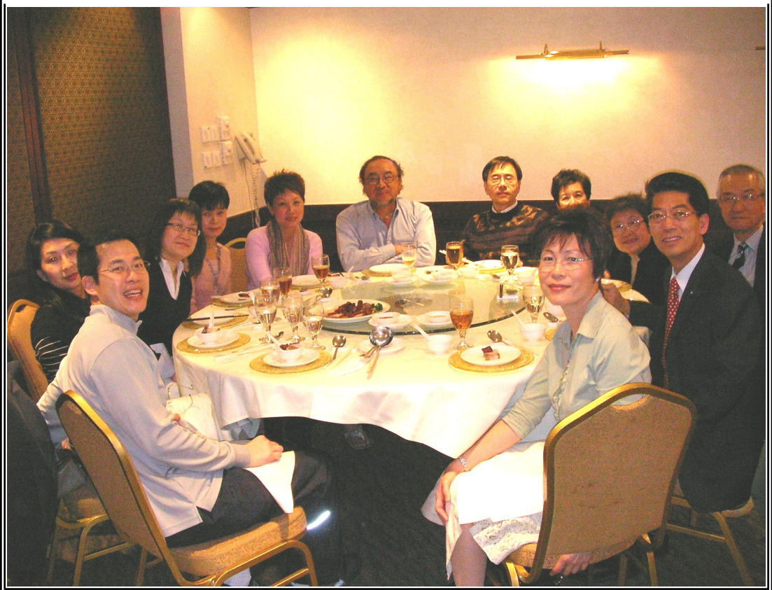
All the wives and Rotarians who came to the prize presentation dinner.