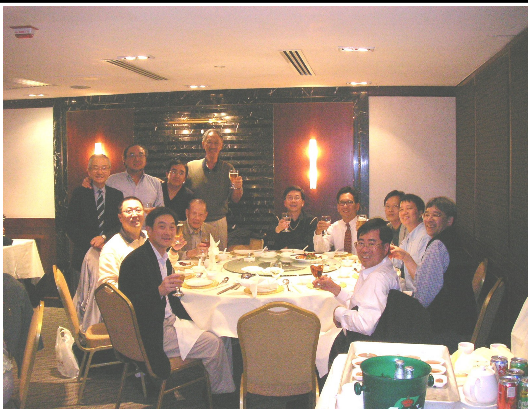
Here are all the golfers who took part in the Tournament.