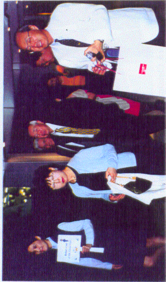
The Island East members and VIP guests were led into Our annual function by the friendly staff of HK Jockey Club.