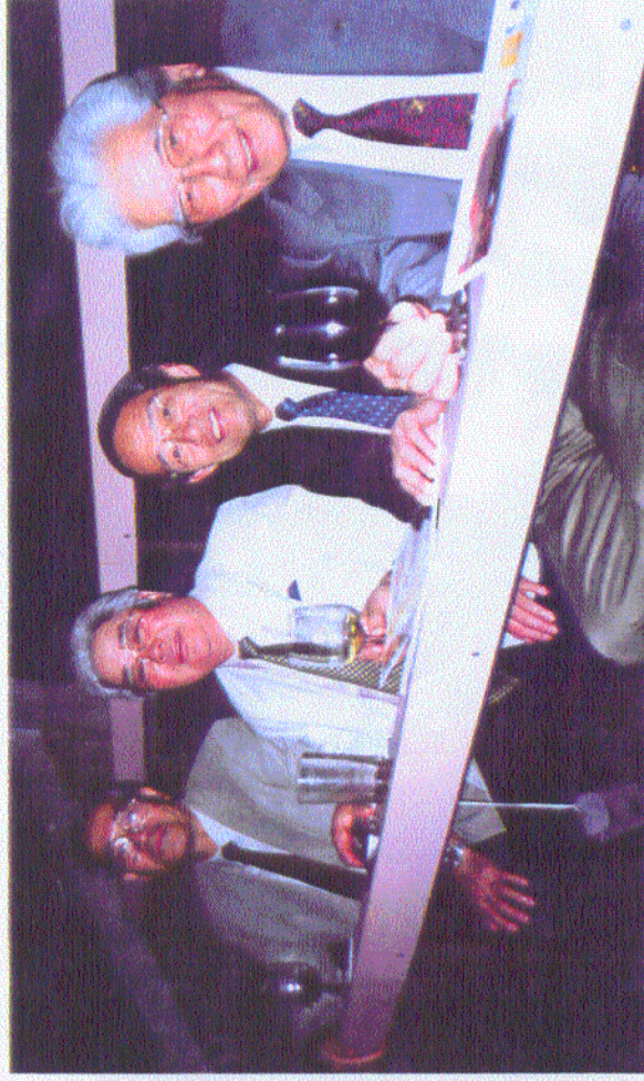
The Osaka Jonan visiting Rotarians enjoying their wine and the racing atmosphere together.