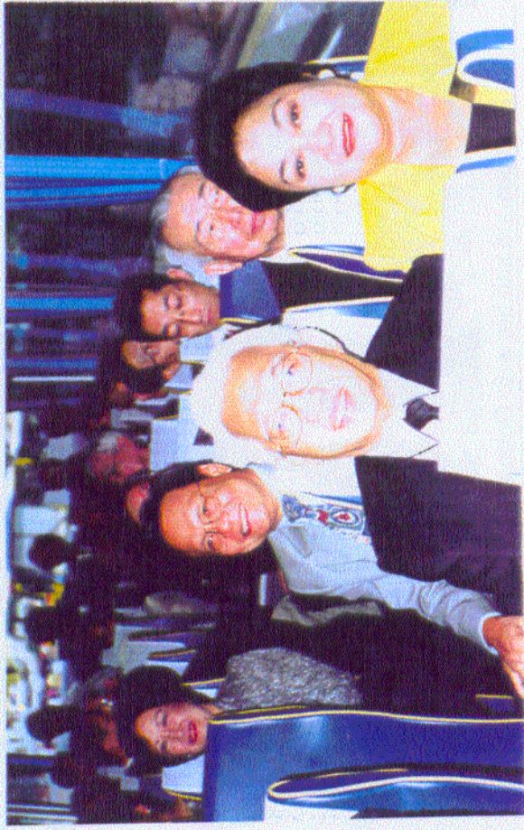
Island East visitors enjoyed a ride to Shatin Race Course.