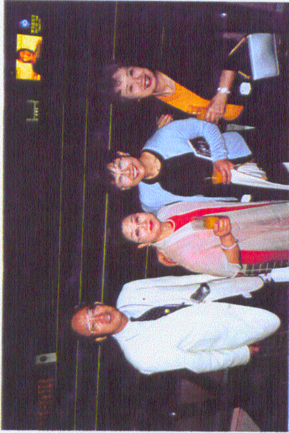
The three Rotariannes from Osaka celebrated their small fortunes in front of the betting pool display.