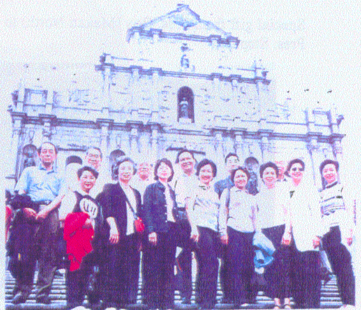
Non-golfers went for the Ruin of St. Paul.