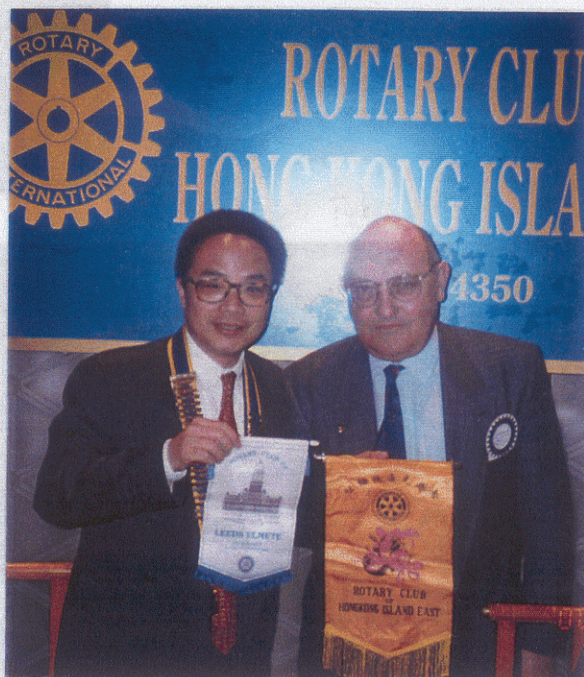
"Mine's bigger than yours!"

香港東區扶輪社週報 THE ROTARY CLUB OF HONG KONG ISLAND EAST