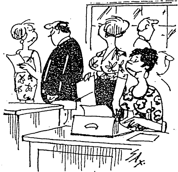
"He still chases after women — but only downhill."

Never argue with an idiot. The drag you down to their level, then beat you with experience.