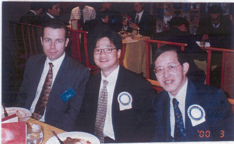
Three Wise Men.