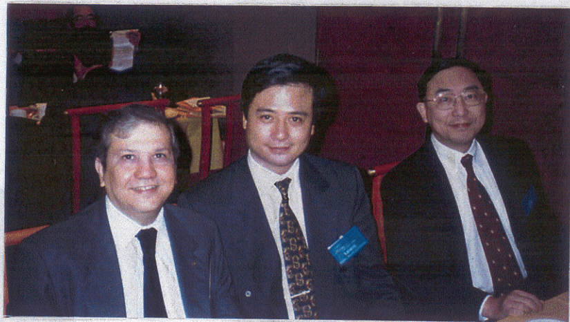
"The Good, the Bad & the Ugly".

香港東區扶輪社週報 THE ROTARY CLUB OF HONG KONG ISLAND EAST