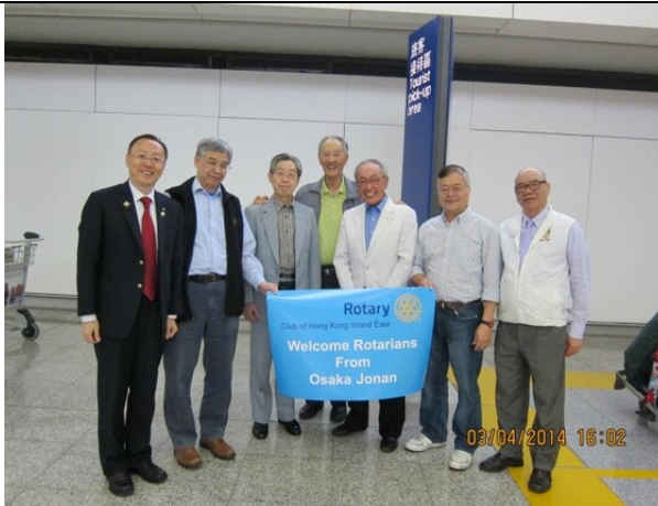
We got our first customer with Osaka Jonan