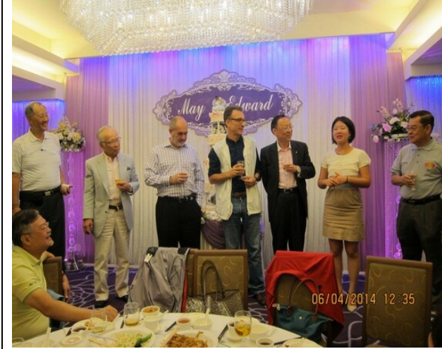
Voter of thanks