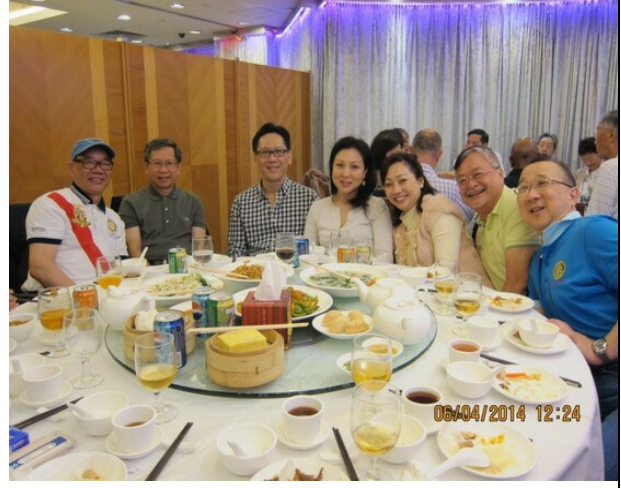
All HKIE with only one guest??