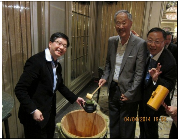
Welcome Saki drinks