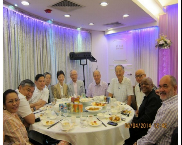
More photos of our Rotarian friends