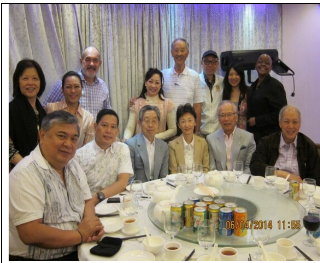
Farewell Lunch with all visitors