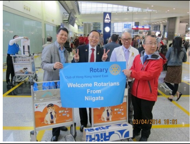
One of the welcome posters