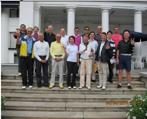
We played golf on the 4 th of April