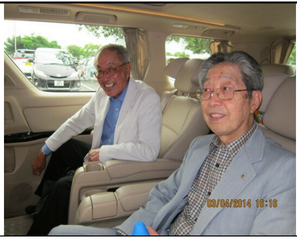
Two of our guests seated in the van.