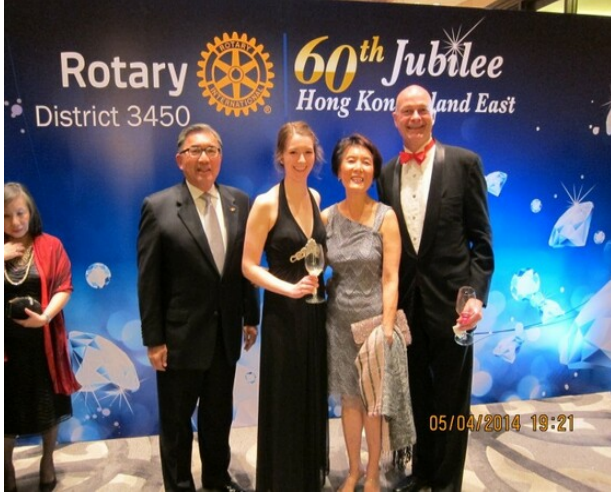
Four friends from USA