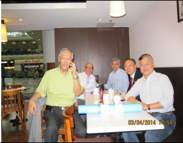
Welcoming committee at the airport