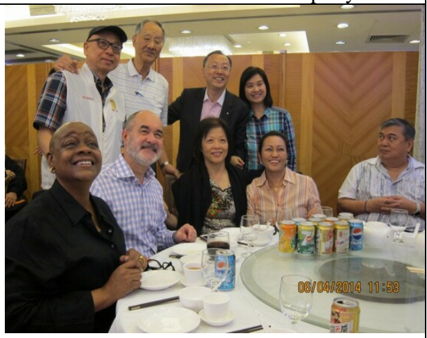
The farewell lunch with our guests from our sister club, the Rotary Club of Makati North from the Philippines