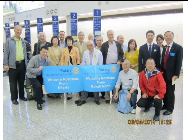
“Bingo” two groups together