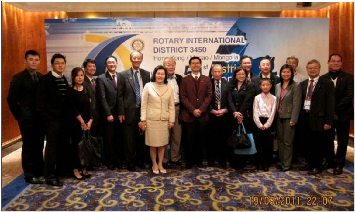
Group photo with guest & members