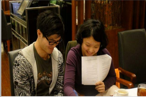
Rotaractors enjoyed the seminar every much !