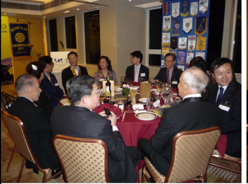
(L to R) Head Table included PDG Uncle Peter, PDG YK and all the daughter clubs' Presidents