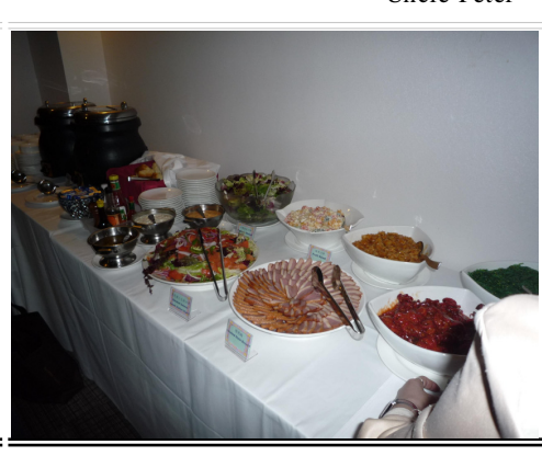
Delicious food at CCC