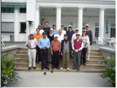
Golfer including RC of Osaka Jonan, RC of Makati North and RC of HK Island East