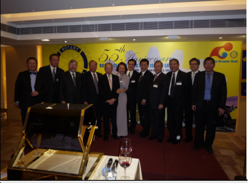
Rotarians from RC of Hong Kong North