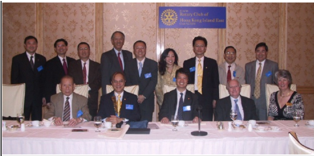
Group photo with members and all the visiting Rotarians